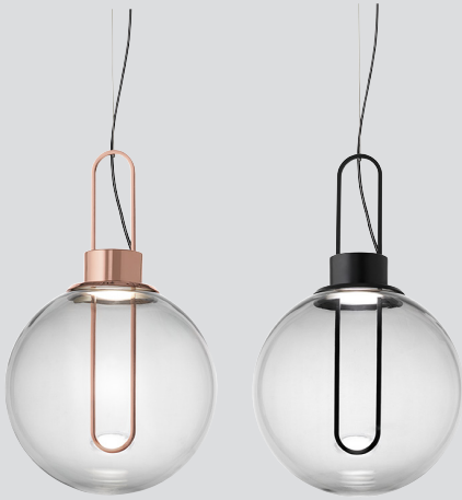
ORBESO025M02 – BLACK ORBESO025M04 – COPPER

— Sospensione singola o in composizioni a grappolo. Globo diffusore in PMMA fumé e struttura in metallo verniciato in bianco opaco o nelle finiture galvaniche: cromo, rame, ottone. Rosone in tinta con la struttura.